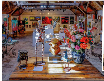
Institute of Oil Painters.